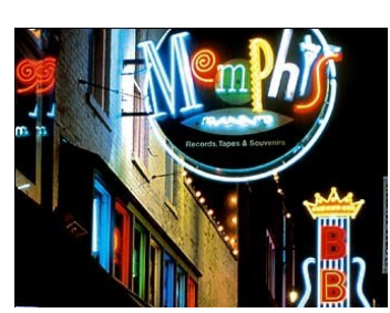
INFO ONLY Reservations Available This September