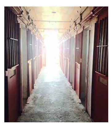
INFO ONLY Reservations Available This September

Join us for an exclusive look inside the gates of one of America's most infamous prisons as we embark on a tour of second chances, rehabilitation and redemption. Experience the struggles of life-term inmates inside Angola Prison, formerly America's most dangerous penitentiary. Today, Angola is known as a model facility and takes great pride in the faith-based rehabilitation of its inmates, most of whom will never regain their freedom. We'll take you inside the barbedwire fences for an up-close look that may change what you thought you knew about life inside.