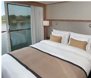
French Balcony (D & C)