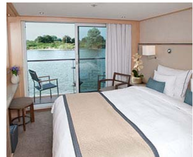
Veranda Cabin (B & A)