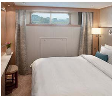
Standard Cabin (E)