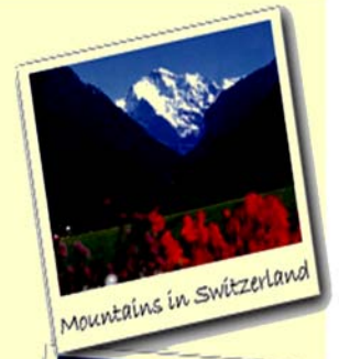
Mountains in Switzerland

705 Bloomfield Ave, Bloomfield, CT 06002 860-243-1630 • 800-243-1630 www.friendshiptours.net