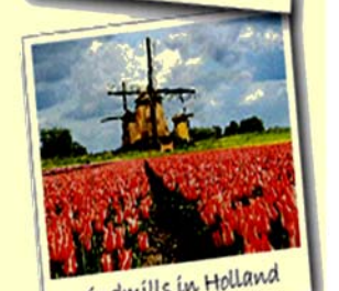
Windmills in Holland

This package is subject to our full terms and conditions which can be found on our website at https://www.friendshiptours.net/tour-policies . Paper copies are available upon request. By signing up to participate in the tour, you are agreeing to be bound to these terms and conditions. Therefore, you must read the terms and conditions in their entirety. By signing up for the tour, making a payment and continuing to use our services, you are agreeing to be bound by the Terms and Conditions. Should you disagree with any of the terms you must speak with us before signing up for a tour. Cruise lines reserve the right to alter itineraries including change or cancellation of ports. These changes will not be considered a material change and will not be considered cause for cancellation or refund by the guest.