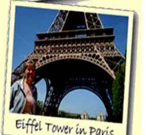
Eiffel Tower in Paris